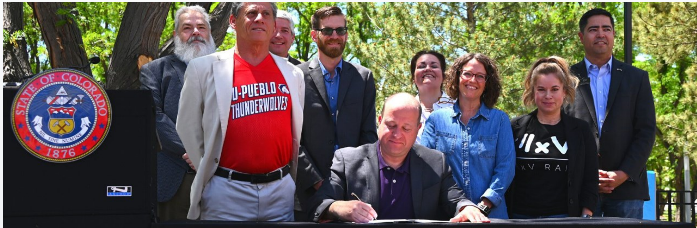
Governor Polis signing the bill to establish SCITT