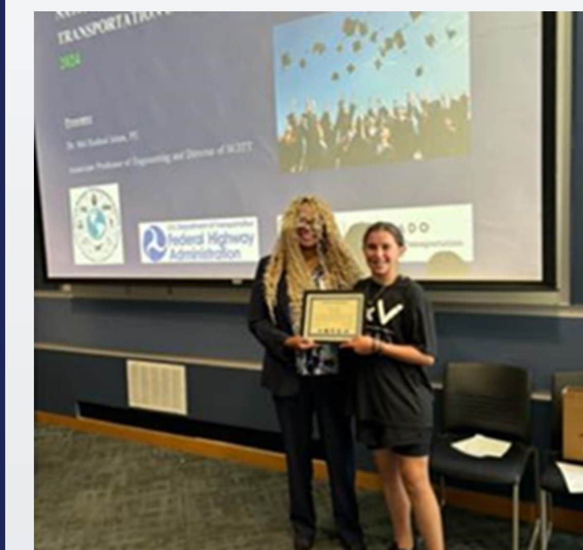
Student Receiving Award