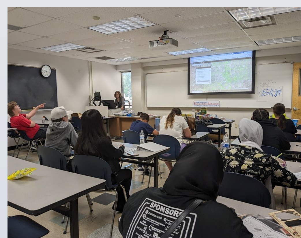
Traffic Crash Lecture