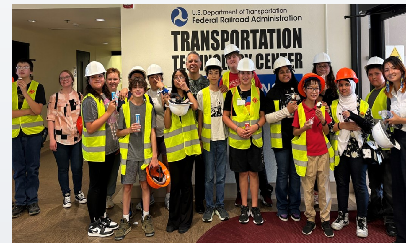
USDOT's TTC Center