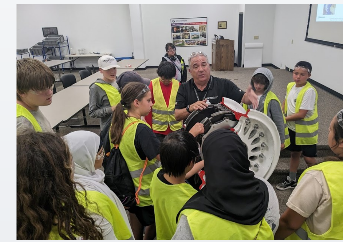
Collins Aerospace Labs