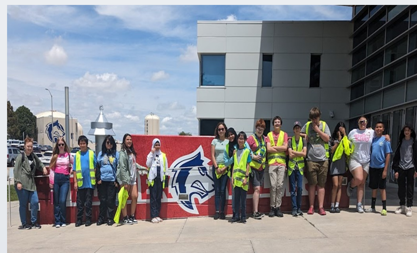
Sports and Recreation