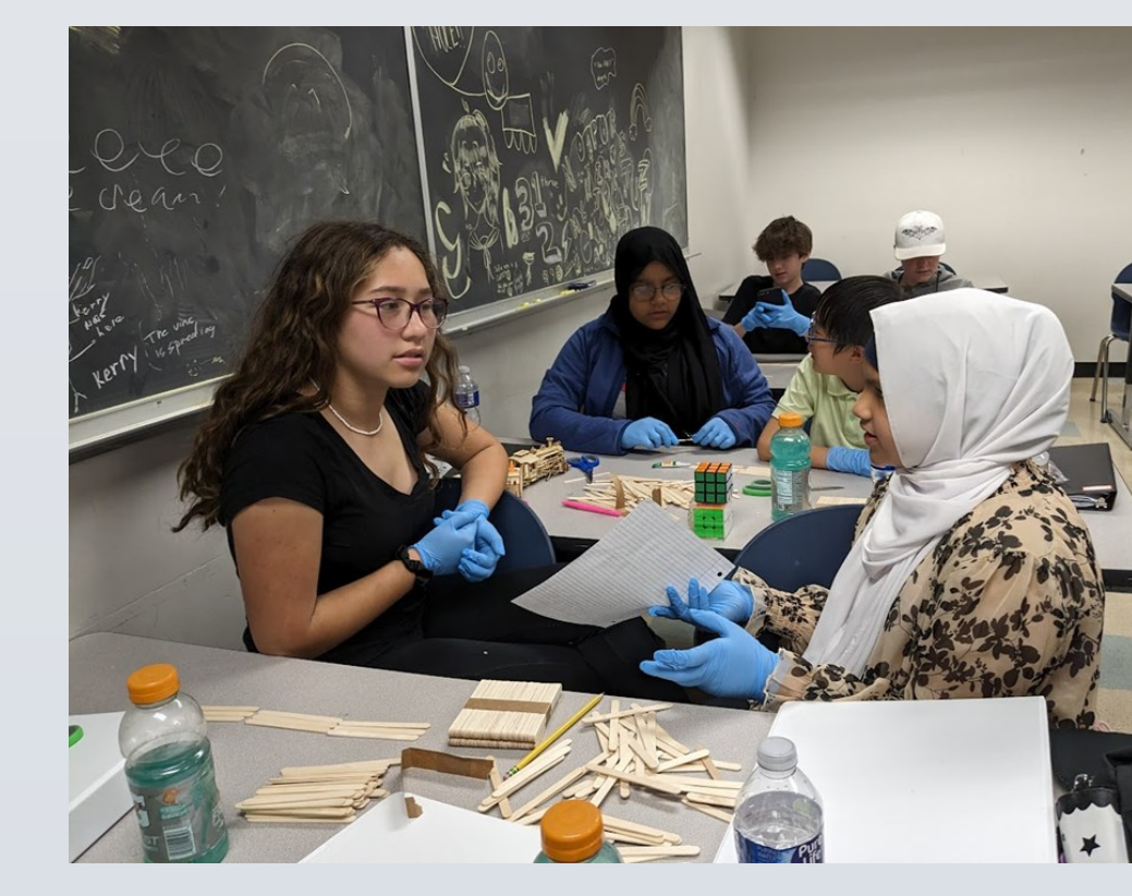
Popsicle Bridge Building