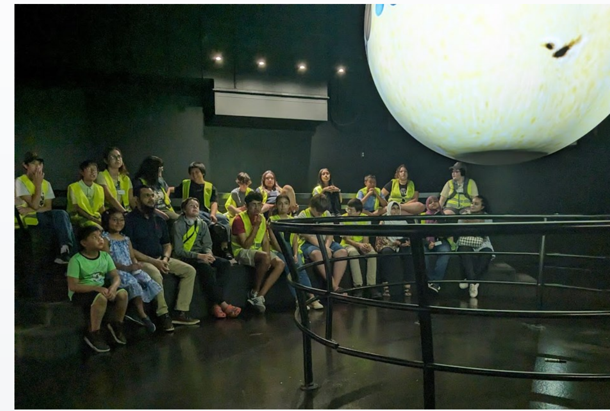
Space Discovery Center