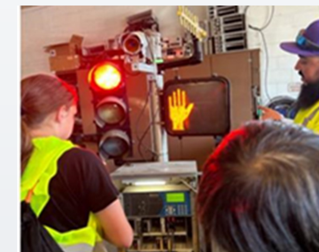
Pueblo Traffic Office