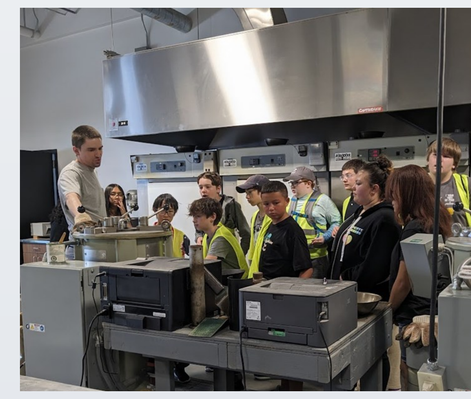
CDOT Pueblo Labs