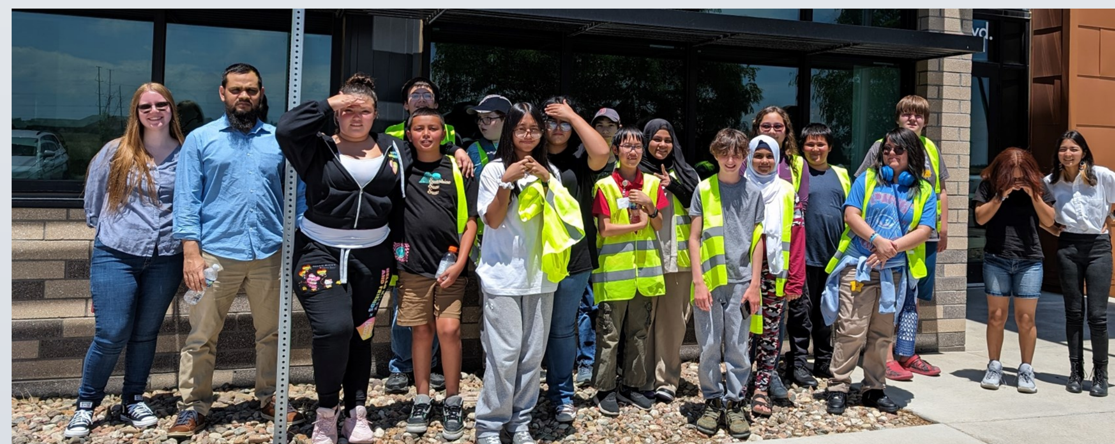
NSTI Group Outside CDOT Pueblo