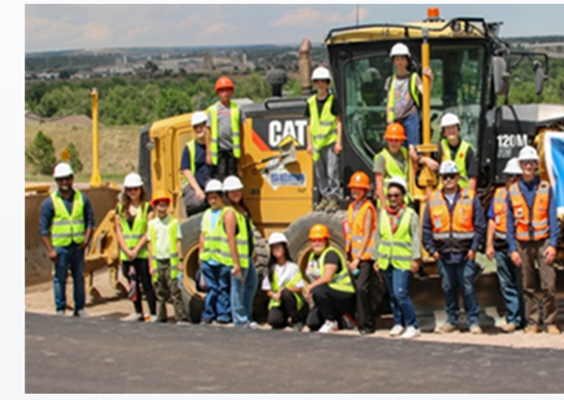
I-25 Improvements Project