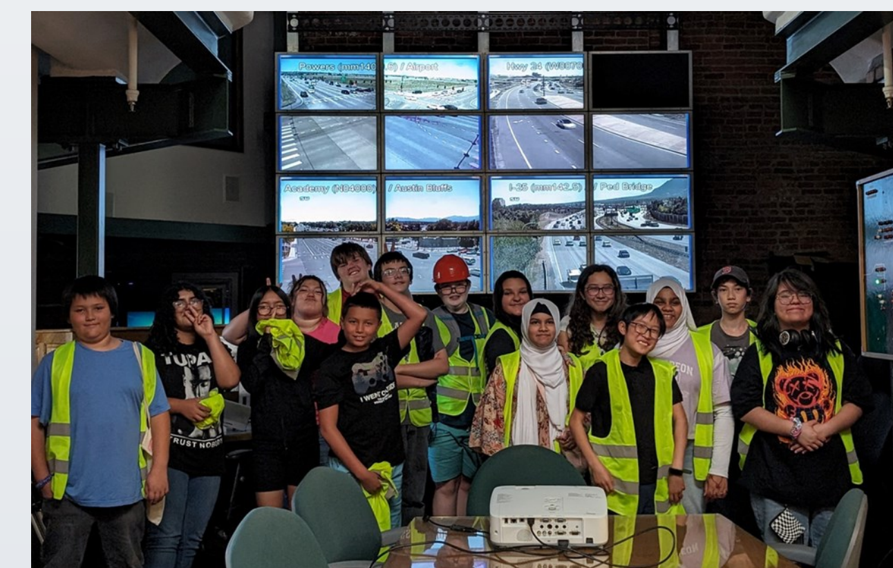
Springs Traffic Management