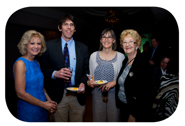
Donors enjoying "Brews & Bites" at the President's Club Thank You Reception.