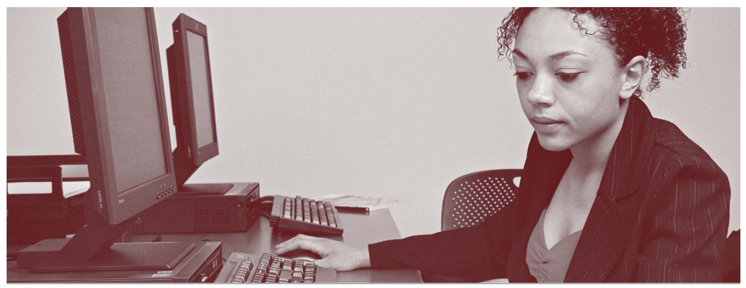
40 Money Management Tips Every College Student Should Know | 14