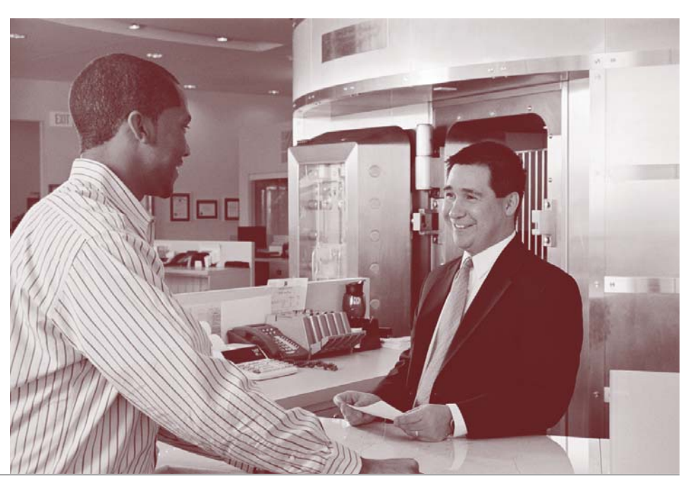
40 Money Management Tips Every College Student Should Know | 24