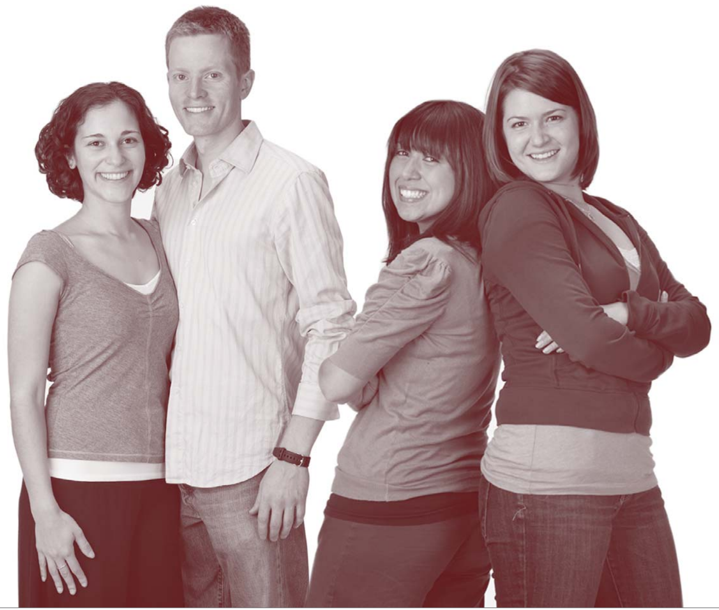
40 Money Management Tips Every College Student Should Know | 25